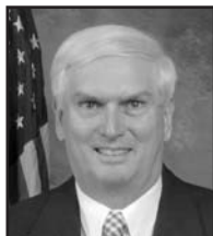
Congressman John Duncan Jr.

I serve on three committees and several subcommittees in the U.S. House of Representatives. However, I have always regarded the Transportation and Infrastructure Committee as my main one.